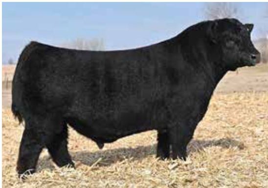
RJC Patron 8556F ET