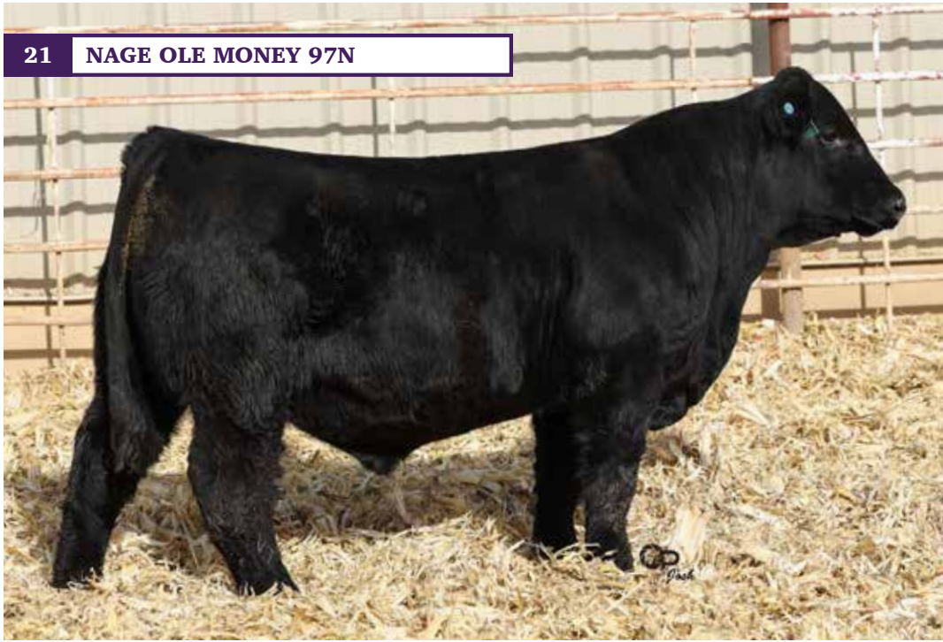
21 NAGE OLE MONEY 97N