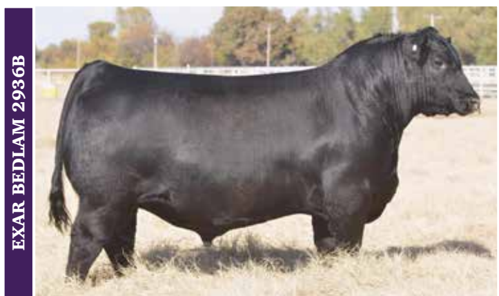
EXAR BEDLAM 2936B