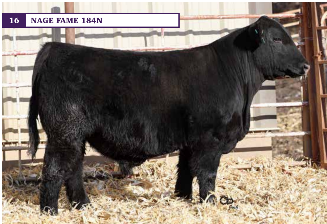
16 NAGE FAME 184N