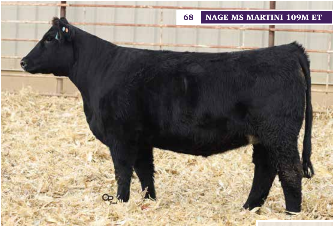
68 NAGE MS MARTINI 109M ET