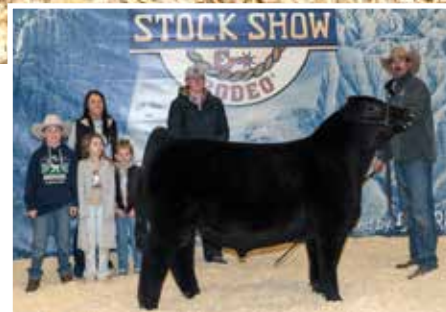
2025 Black Hills Stock Show Champion Maine-Anjou Bull sired by NAGE Rushmore 169H ET