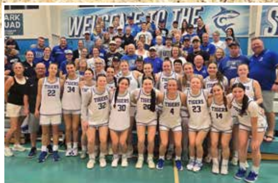
Two wins in Hawaii (December 2025).