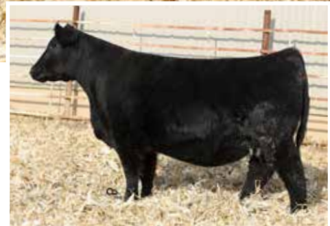
Maternal sib to Lot 19, sired by Fame, sold in 2025 to Reimann Ranch (Ree Heights, SD) for $22,000.