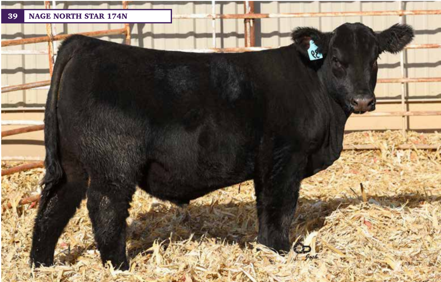
39 NAGE NORTH STAR 174N