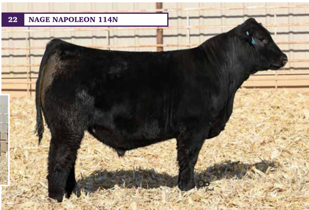
22 NAGE NAPOLEON 114N