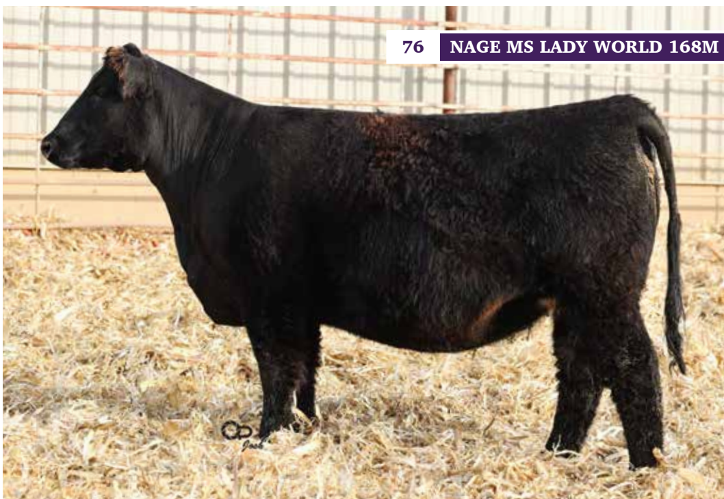
76 NAGE MS LADY WORLD 168M