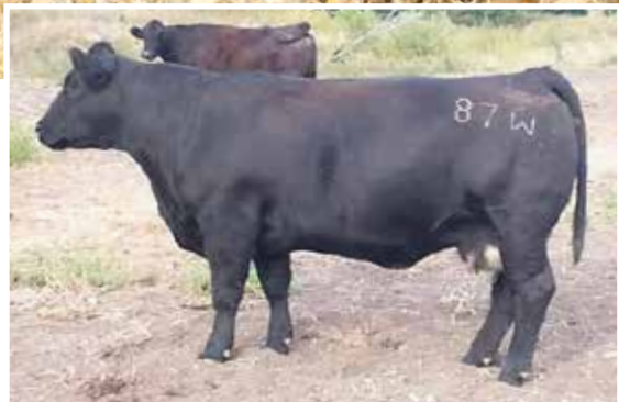
NAGE Ms Open Bar 87W