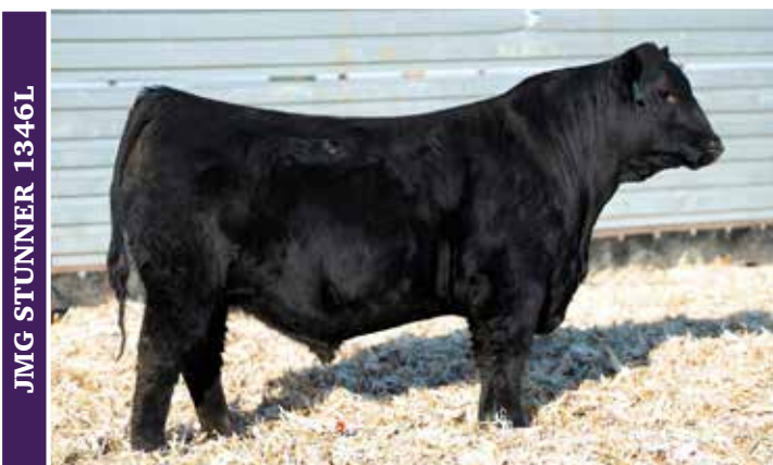
JMG STUNNER 1346L