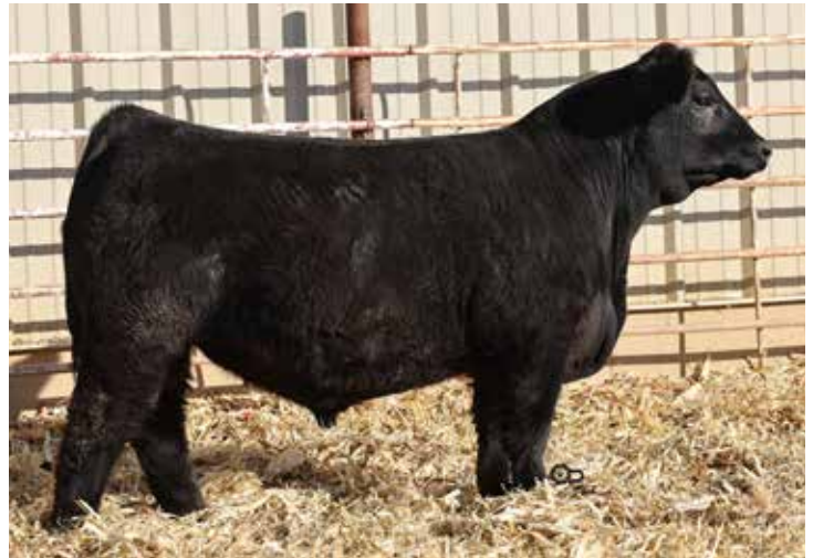
55 NAGE BELLRINGER 16N