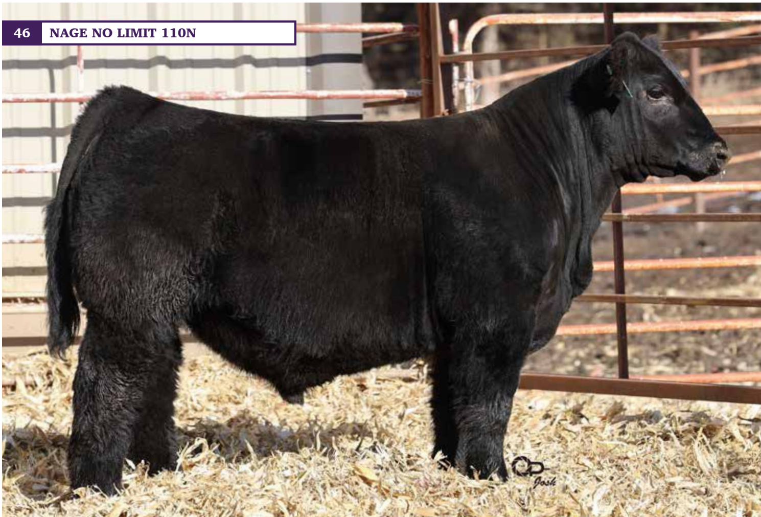
46 NAGE NO LIMIT 110N