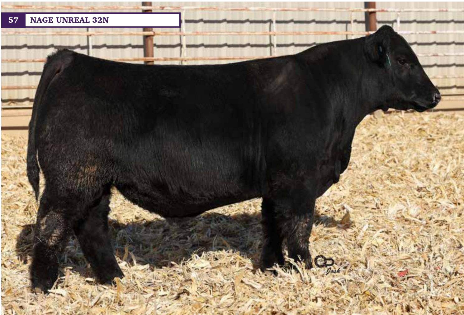
57 NAGE UNREAL 32N