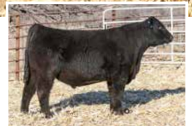
Maternal sib to Lot 1 by Banker Hours 2F sold our in 2022 Sale