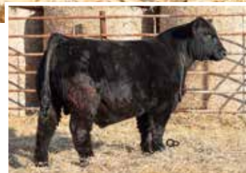
Maternal sib to Lot 1 by Icon sold in our 2023 Sale