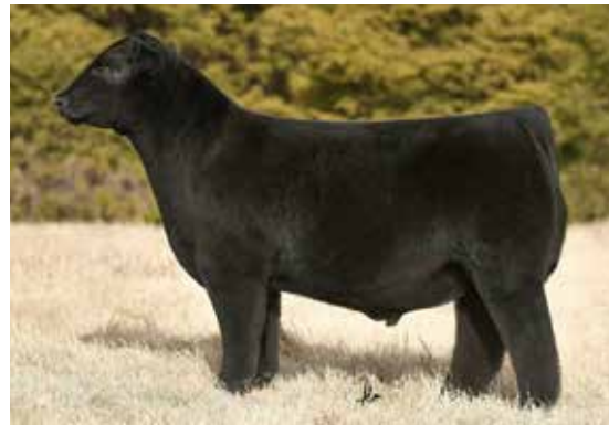
K&A Promise Keeper 23K