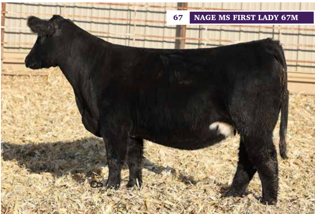
67 NAGE MS FIRST LADY 67M

BRED TO: BEDLAM DUE DATE: FEBRUARY 24, 2026