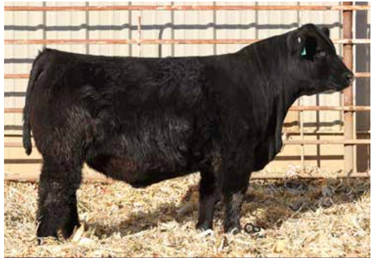
54 NAGE SPOT ON 12N