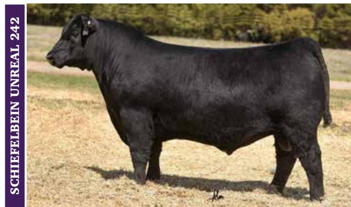
SCHIEFELBEIN UNREAL 242