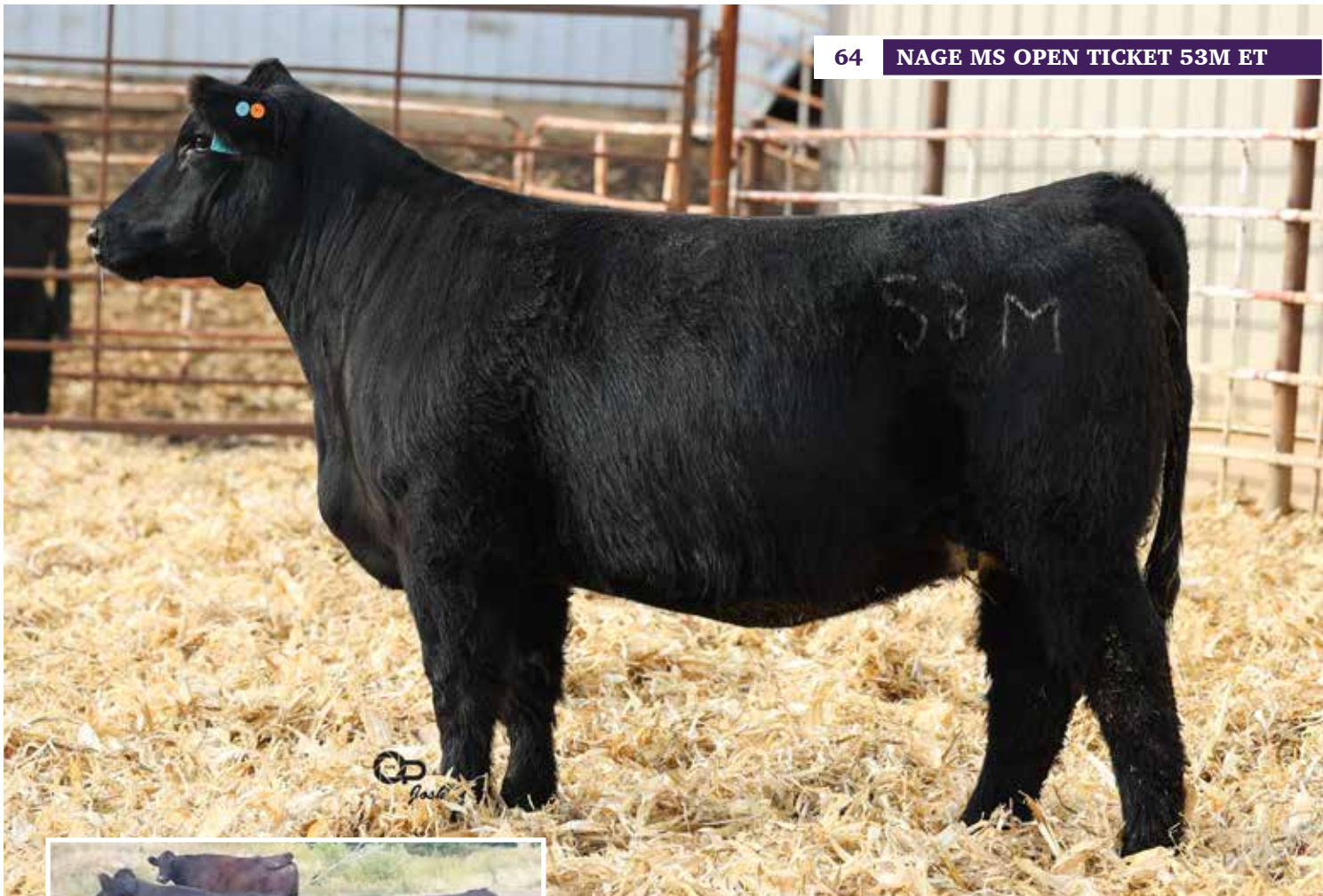
64 NAGE MS OPEN TICKET 53M ET