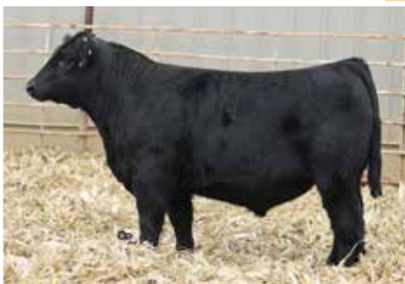
Maternal sib to Lot 22, sired by Fame, sold in 2025 for $10,000 to Tevin Shuckburgh (Canada).