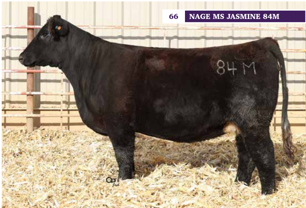
66 NAGE MS JASMINE 84M