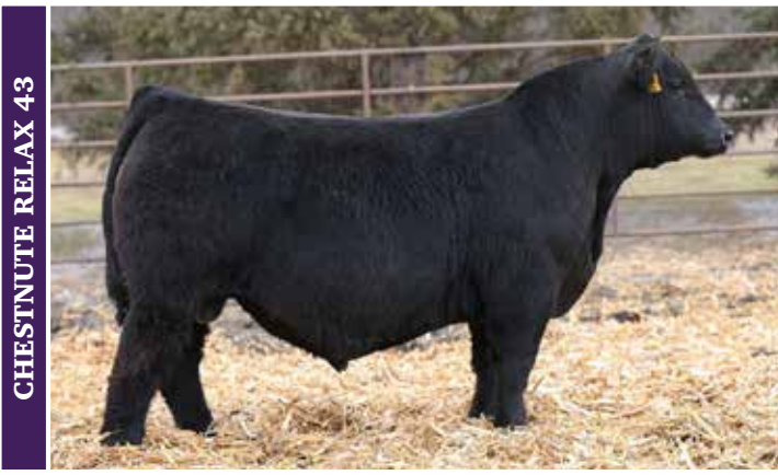
CHESTNUTE RELAX 43