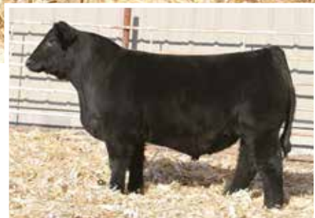
NAGE Rushmore 169H ET sold for $22,000 to Beauprez Land & Cattle (Byers,CO).