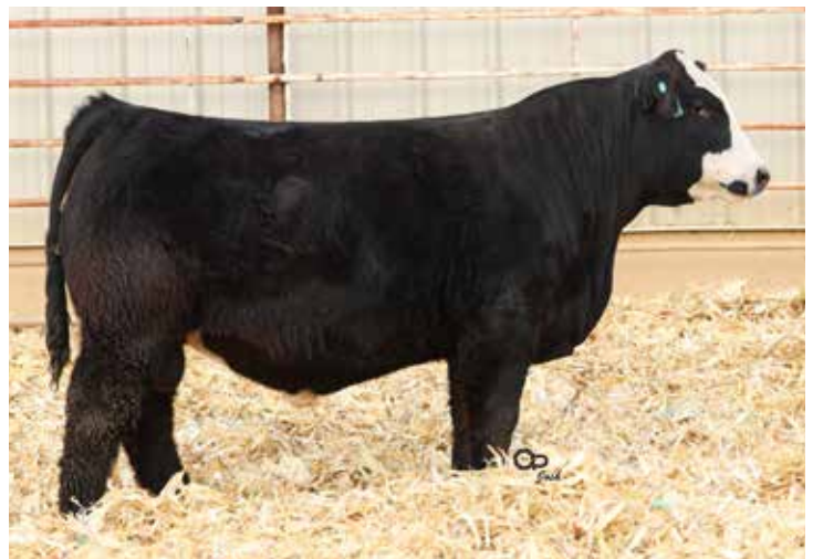
56 NAGE SPOT ON 19N